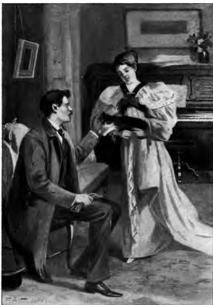
"Don't you admire him?"—Page 88